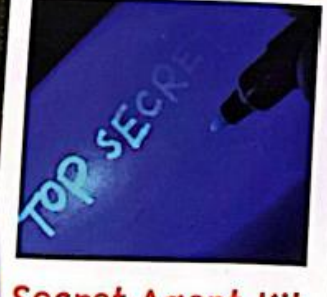
Secret Agent Kit