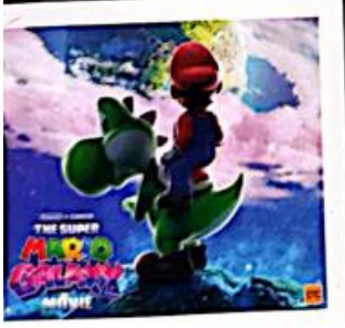
Pass the popcorn!