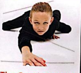
The Great Escape!