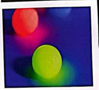
Bounce Bounce Glow!